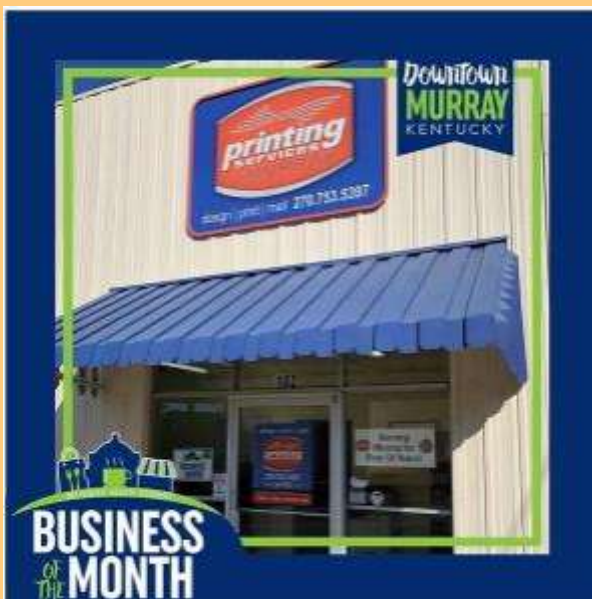
We love how Murray Main Street highlights a business of the month!