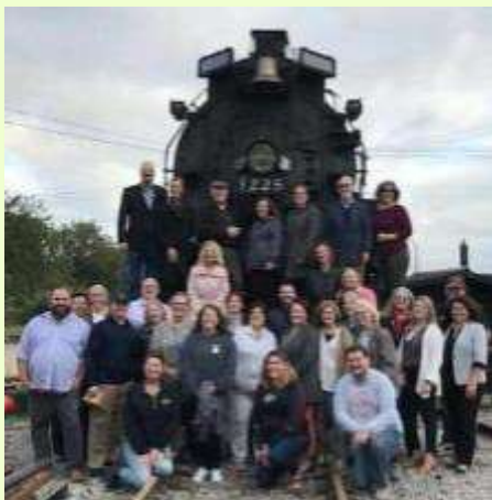
Yes, that is the real Polar Express with 300 Santas! The film company actually used this train in the movie. The Santas were in town for a visit. They attend the Charles W. Howard Santa school in a nearby town and come for a photo and ride every year. We were also able to ride along with them.