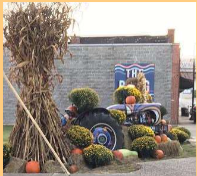
Williamsburg is ready for fall! Check out that tractor, it is public art for sure!