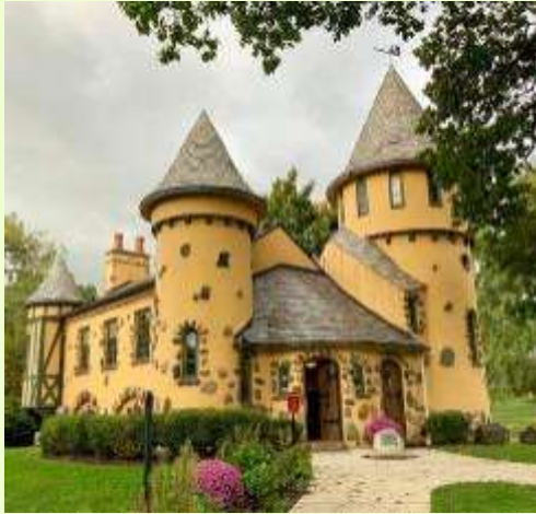
Curwood Castle was the writing studio for one of America's greatest authors of his time. James Oliver Curwood was an Owosso native whose novels were estimated to have been read by over 7 million people during his time, and whose stories were turned into major motion pictures in Hollywood.

One of Owosso's transformation strategies is upper story housing and the other strategy is "Day Trip Destination." They have the train that the "Polar Express" is based on, Curwood Castle, local public art, and light manufacturing. The light manufacturing are locally made goods such as leather craft from Darker Mfg. Co. They have a showroom in the front and you can watch the goods being made, and all the materials are sourced in America. Foster Coffee Company roasts their own beans and you can watch the process, or you can sit and enjoy a cup of coffee. Watching the process is part of the experience. I love that the entire town (including local government) is working together towards a common goal. I was able to share with their director several of the things that our communities have done to attract upper story housing.